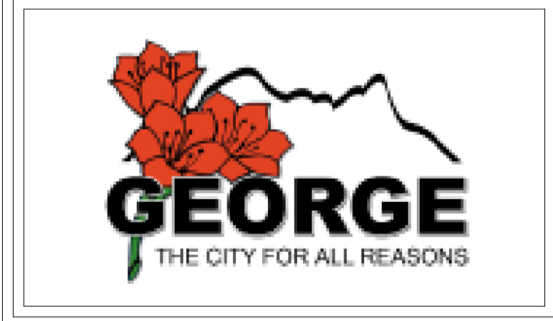
FIGURE No. SDP/PDHMK/1.1